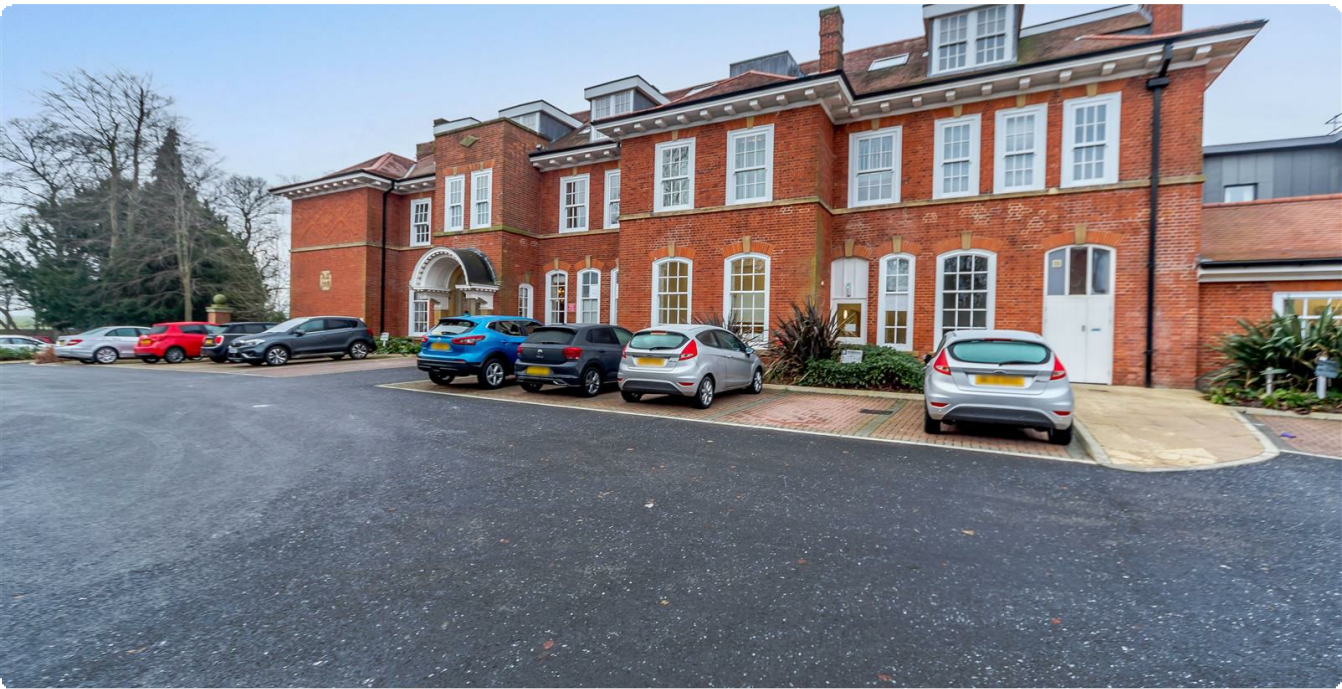
Kenton Lodge, Kenton Road, Newcastle upon Tyne Approximate Gross Internal Area 630 Sq Ft/59 Sq M

Kenton Road, Newcastle Upon Tyne, NE3 4PE