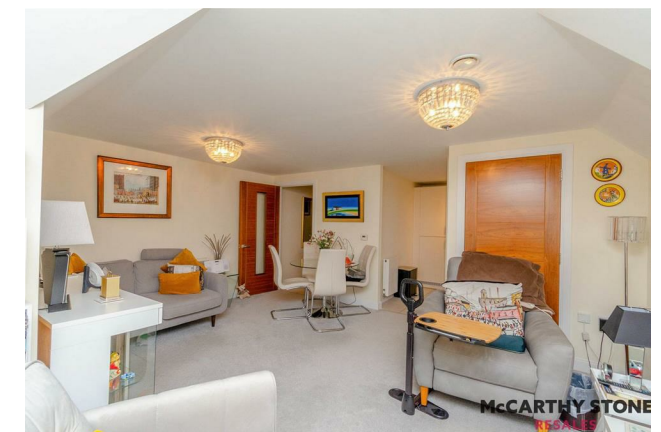
A luxury one bedroom first floor apartment in our prestigious Clock Gardens development for over 55's

The apartment is presented to an immaculate standard throughout and has the benefit of gas central heating. Must be viewed to be fully appreciated.