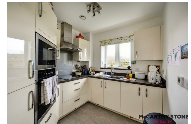
ONE BEDROOM GROUND FLOOR RETIRMENT APARTMENT - RETIRMENT LIVING DEVELOPMENT