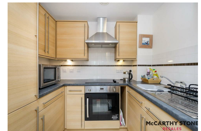
A ONE BEDROOM FOURTH FLOOR RETIREMENT APARTMENT