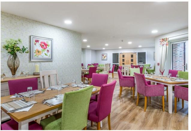
*JOIN US FOR PIMMS & NIBBLES - WEDNESDAY 26TH JUNE - 10am - 4pm - BOOK YOUR PLACE TODAY!*

SUPERBLY PRESENTED and in an 'AS NEW' condition. The bright and airy, DUAL ASPECT living room with access to a PRIVATE WALK OUT BALCONY and stunning COUNTRYSIDE VIEWS. The modern kitchen with BUILT IN APPLIANCES, double bedroom with a WALK-IN WARDROBE and CONTEMPORARY wet room complete this beautiful apartment. -Part Exchange, Entitlements Advice and Solicitors available - speak to your Property Consultant for further information-