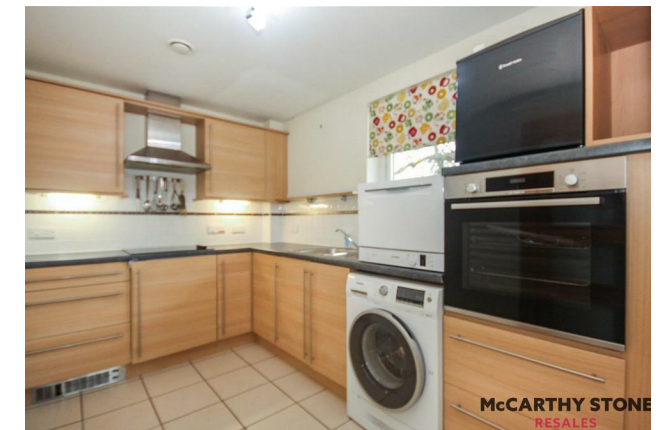
ENJOY LUNCH ON US WHEN YOU TAKE A TOUR OF WILTON COURT - BOOK NOW!

Beautifully presented ONE BEDROOM RETIREMENT apartment in a corner position situated in McCarthy Stone's prestigious WILTON COURT development.