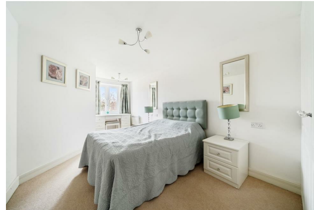
*** IMMACULATE EX SHOW FLAT ***

A spacious and tastefully presented one bedroom, second floor retirement apartment, featuring GARDEN VIEWS and a JULIETTE BALCONY. This development offers a FRIENDLY COMMUNITY and is CLOSE TO LOCAL AMENITIES such as; doctor, dentist, pharmacist, leisure centre with swimming pool and park, local butcher and supermarkets.