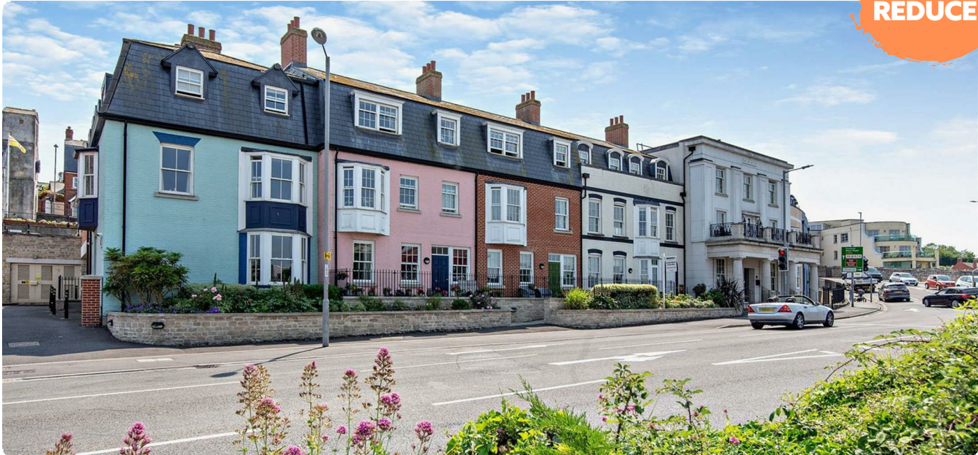
Harbour Lights Court, North Quay, Weymouth Approximate Gross Internal Area 705 Sq Ft/66 Sq M