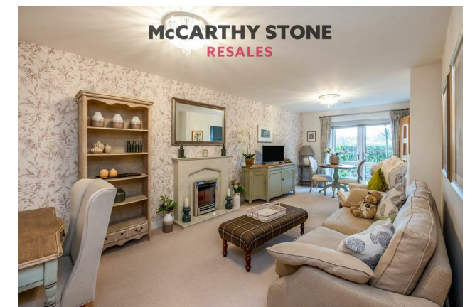
* A Beautifully Presented ONE BEDROOM GROUND FLOOR RETIREMENT APARTMENT*

Part of McCarthy Stones Retirement Living PLUS range for over 70's.