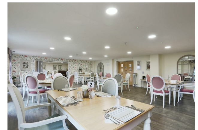
ENJOY LUNCH ON US WHEN YOU TAKE A TOUR OF HARVARD PLACE - BOOK NOW!

A WONDERFULLY presented one bedroom retirement apartment. Located on the FIRST FLOOR. The property boasts a WALK-OUT BALCONY which can be accessed directly from the lounge. The property is also fitted with brand new carpets.