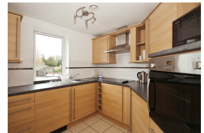
ENJOY LUNCH ON US WHEN YOU TAKE A TOUR OF WILTON COURT - BOOK NOW!