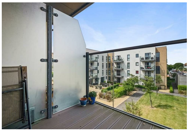
A fantastic ONE BEDROOM Retirement Apartment situated on the SECOND FLOOR of this EXCLUSIVE development. With a west facing BALCONY overlooking the COMMUNAL GARDEN.