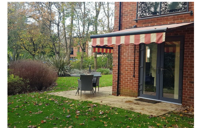
A luxury TWO BEDROOM retirement apartment. Situated on the GROUND FLOOR of our prestigious THORNEYCROFT development in TETTENHALL.

The accommodation briefly comprises of a welcoming entrance hallway, a spacious lounge/dinner with FRENCH DOORS to a walk out DOUBLE PATIO AREA with SUNNY ASPECT and two remote control awnings. Modern fitted kitchen with INTEGRATED APPLIANCES, two double bedrooms, SHOWER ROOM AND GUEST WC. Viewing is highly recommended to fully appreciate the accommodation on offer. Situated in a lovely location with woodland views at the rear of the complex.