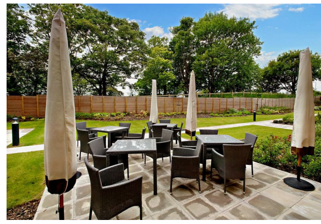
*Join us for coffee & cake - Wednesday 14th May 2025 - from 9.30am - 2pm - book your place today!*

~ PART EXCHANGE, ENTITLEMENTS ADVICE, REMOVALS AND SOLICITORS ALL AVAILABLE ~ A SPACIOUS two bedroom first floor apartment with modern kitchen, walk in wardrobe to master and large walk in shower, situated within a popular MCCARTHY STONE retirement living development.