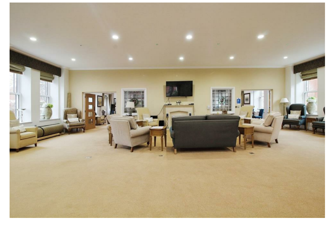
ENJOY LUNCH ON US WHEN YOU TAKE A TOUR OF HARVARD PLACE - BOOK NOW!

A SUPERBLY PRESENTED one bedroom retirement apartment, situated on the FIRST FLOOR and boasting a spacious WALK-OUT BALCONY with AMAZING SCENIC VIEWS.