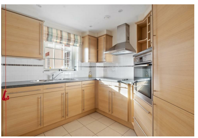
ENJOY LUNCH ON US WHEN YOU TAKE A TOUR OF CLARIDGE HOUSE - BOOK NOW!

This beautiful one bedroom retirement apartment has plenty of large windows to allow the sunlight to stream in. Located on the first floor near to the lift, in the middle of the development. Claridge House is a flat, short walk to the sea side. ONSITE RESTAURANT with table service, hairdressers, ART STUDIO.