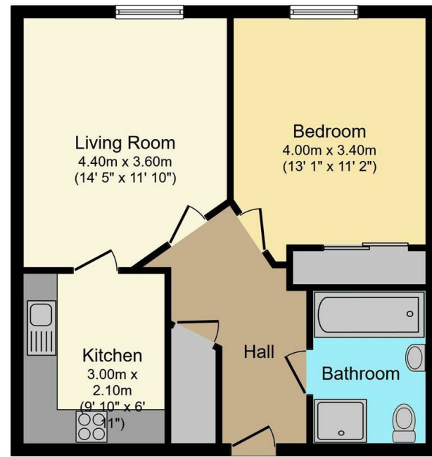
Floor Plan Floor area 53.0 sq. m. (570 sq. ft.) approx

Total floor area 53.0 sq. m. (570 sq. ft.) approx This Floor Plan is for illustration purposes only and may not be representative of the property. The position and size of doors, windows and other features are approximate. Unauthorized reproduction prohibited. © KeyAGENT