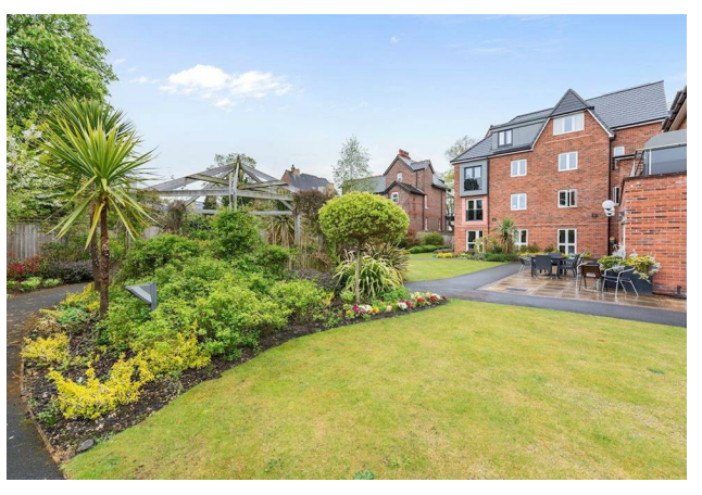
ENJOY LUNCH ON US WHEN YOU TAKE A TOUR OF OAKFIELD COURT - BOOK NOW!

A SPACIOUS TWO BEDROOM corner open plan APARTMENT with garden views on the THIRD FLOOR of this age exclusive OVER 70'S MCCARTHY STONE RETIREMENT LIVING PLUS DEVELOPMENT. Well placed for a wide range of local amenities and transport links.