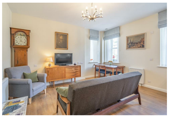
ENJOY LUNCH ON US WHEN YOU TAKE A TOUR OF WILLIAMSON COURT - BOOK NOW!

A modern one bedroom, second floor, retirement apartment with beautiful views and lovely communal areas. This apartment has an open plan kitchen/diner. ONE HOUR OF DOMESTIC ASSISTANCE INCLUDED PER WEEK. New carpets throughout.