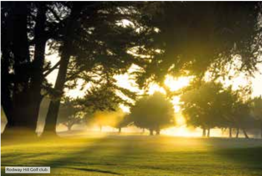
Rodway Hill Golf club

Whether you are a skilled golfer or a beginner you can practice your swing at Rodway Hill Golf club, just a short walk from home. This beautiful club offers a challenging course and a driving range.