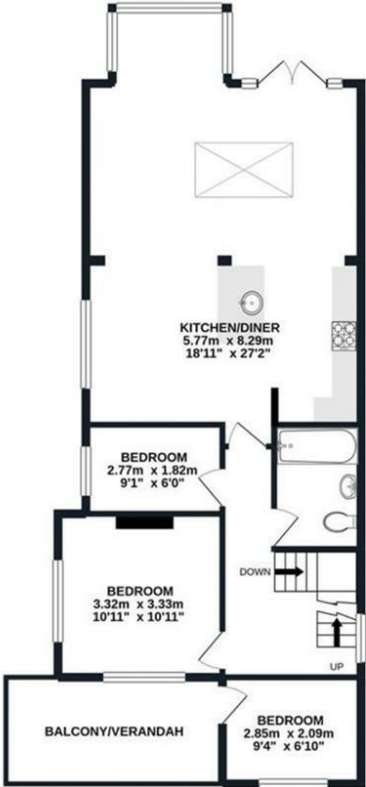
1ST FLOOR 79.1 sq.m. (852 sq.ft.) approx.