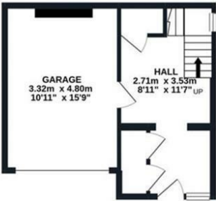
GROUND FLOOR 30.5 sq.m. (328 sq.ft.) approx.