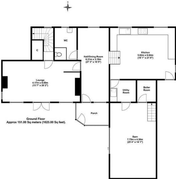
Ground Floor Approx 151.00 Sq meters (1625.00 Sq feet).