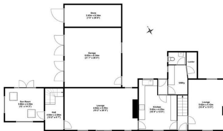
Ground Floor Approx 168.00 Sq meters (1808.00 Sq feet) Floor size includes double garage