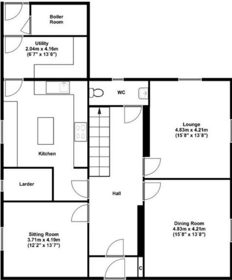
Ground Floor Approx 129.00 Sq feet (1389.00 Sq feet).