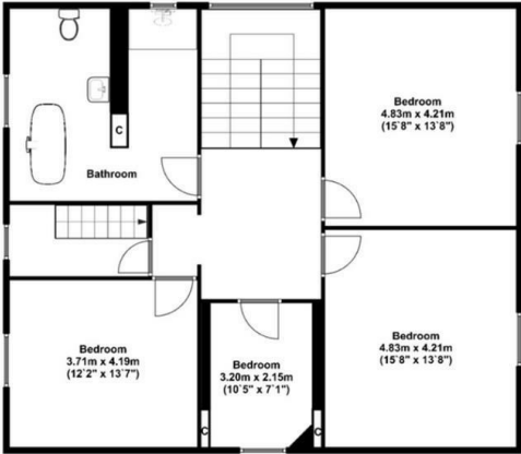
First Floor Approx 118.00 Sq meters (1270.00 Sq feet).