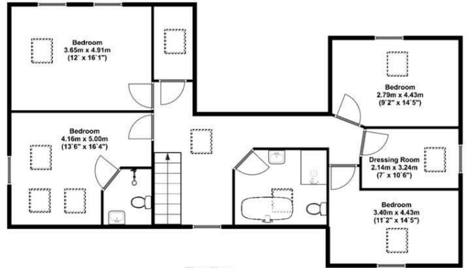
First Floor Approx 109.00 Sq meters (1173.00 Sq feet).