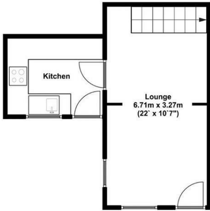
Ground Floor Approx 30.00 Sq feet (323.00 Sq meters).