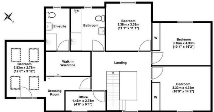
First Floor Approx 99.00 Sq meters (1066.00 Sq feet).