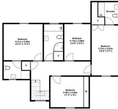
First Floor Approx 99.00 Sq meters (1066.00 Sq feet).