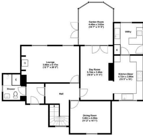
Ground Floor Approx 120.00 Sq meters (1292.00 Sq feet).