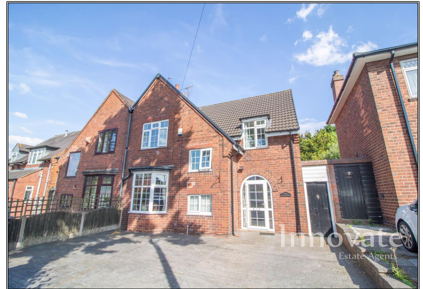
Vicarage Road, Oldbury, West Midlands, B68 8HR