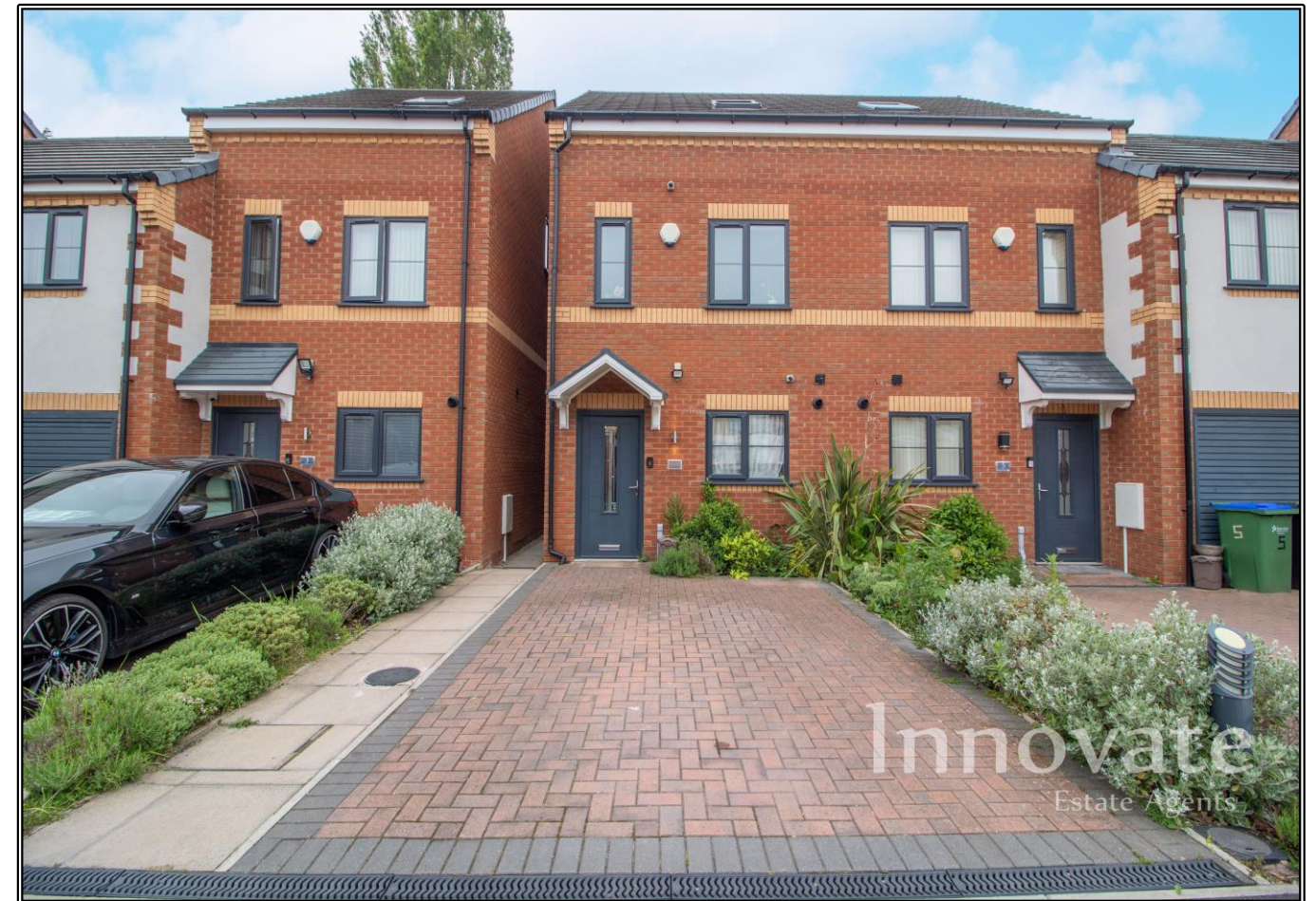
King Edward Close, Oldbury, West Midlands, B68 8BN