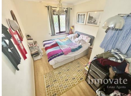
Church Street, Oldbury, Sandwell, B69 3AG