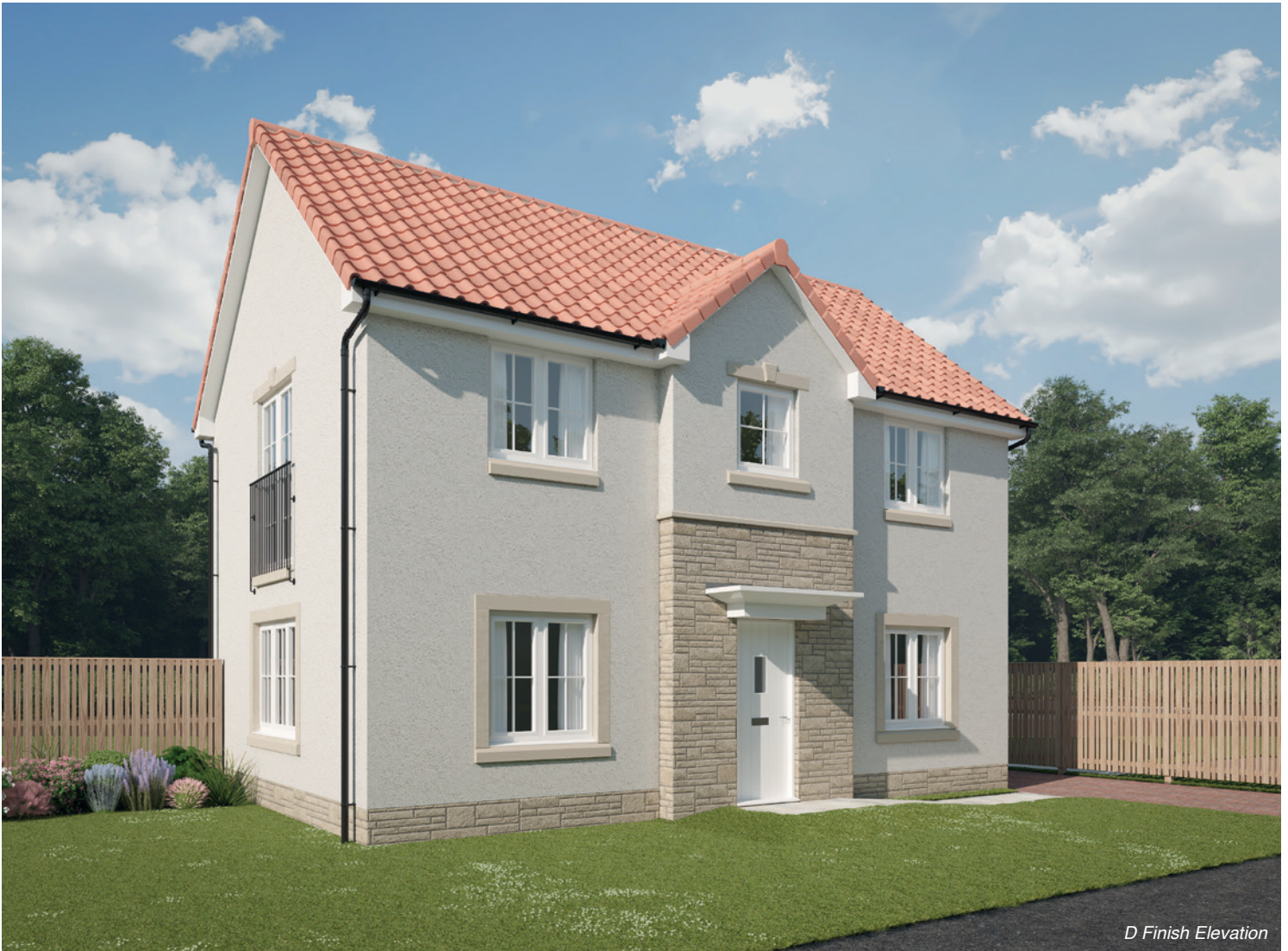
D Finish Elevation

Please note Photo Voltaic (solar) panels shown above are indicative only. The location and number of panels are dependent on plot orientation. Please see Sales Advisor for details.