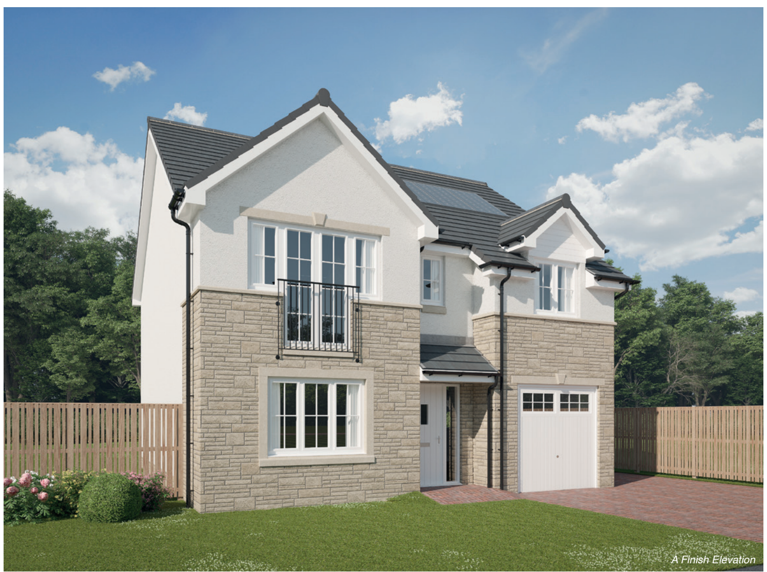
Please note Photo Voltaic (solar) panels shown above are indicative only. The location and number of panels are dependent on plot orientation. Please see Sales Advisor for details.

FOUR BEDROOM DETACHED HOME WITH INTEGRAL GARAGE