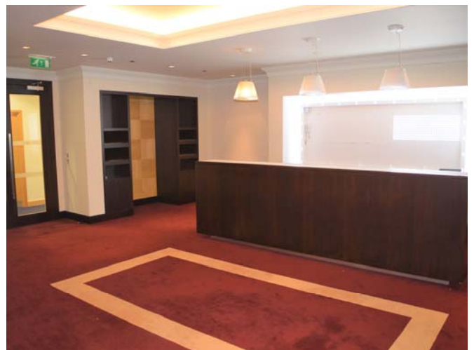
Particulars for Eastwood House, Glebe Road, Chelmsford, CM1 1QW