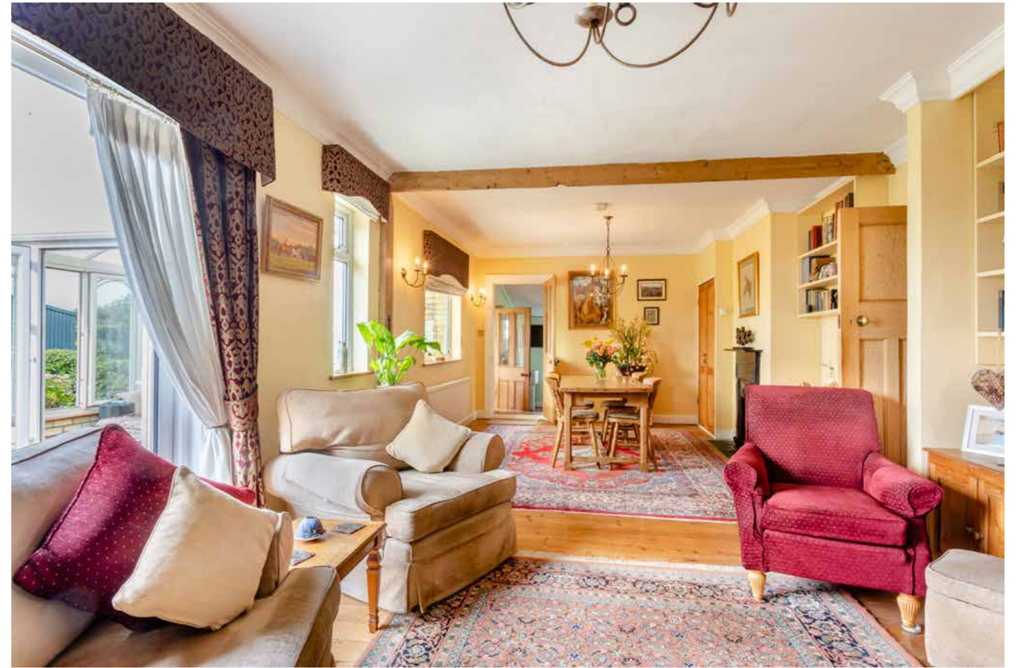
"We enjoy winter evenings in this room, relaxing in front of the fire..."