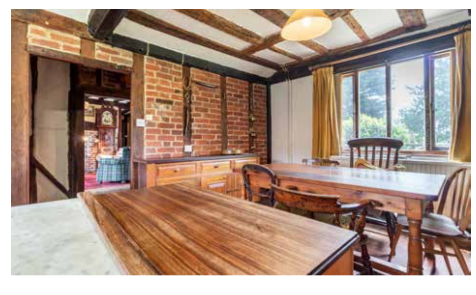
Full of character and charm