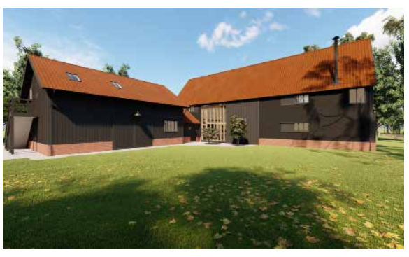
CGI showing developed barn