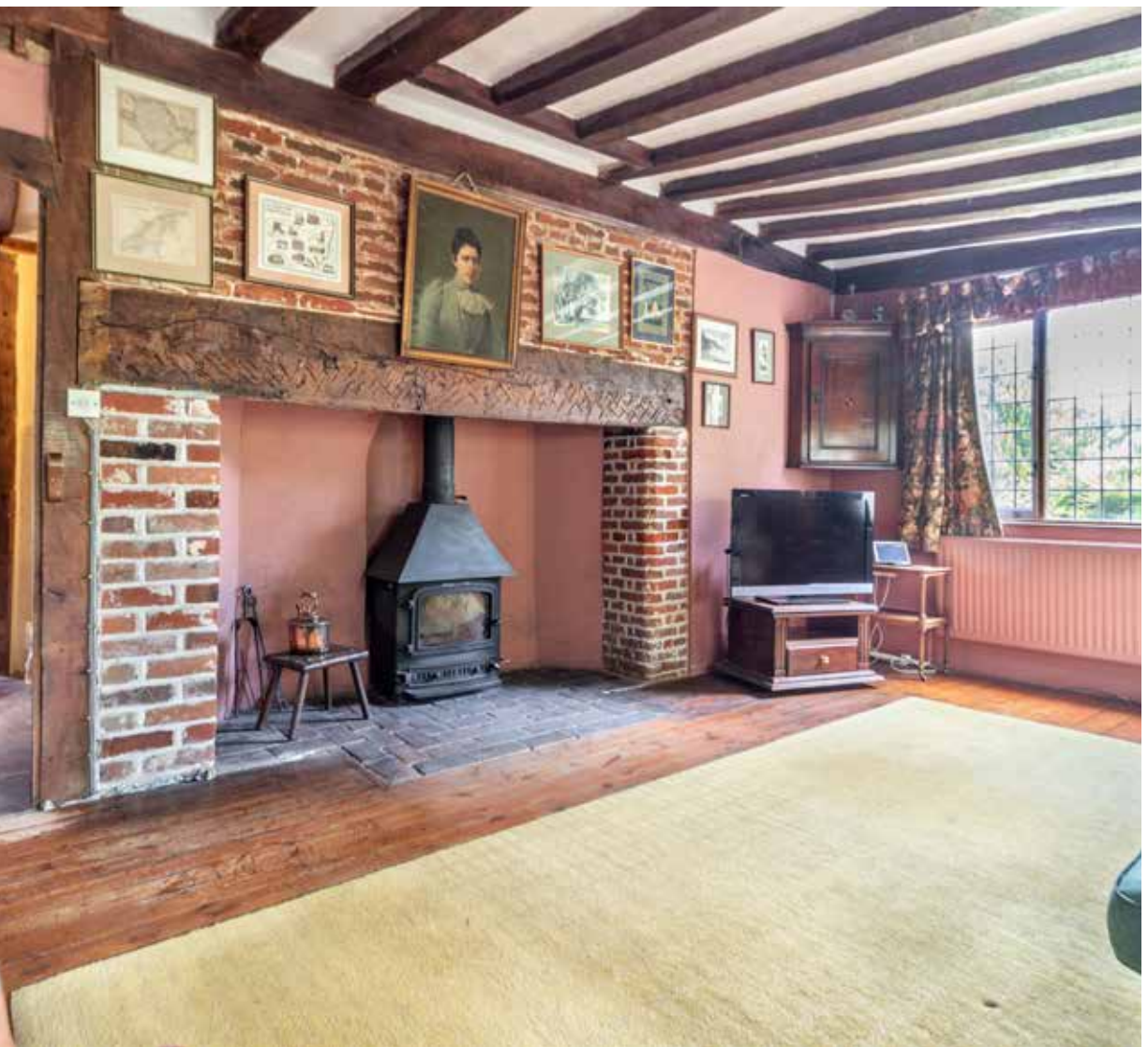
"...the dual aspect sitting room with its stone flagged floor, brick inglenook fireplace with wood burner and exposed beams."