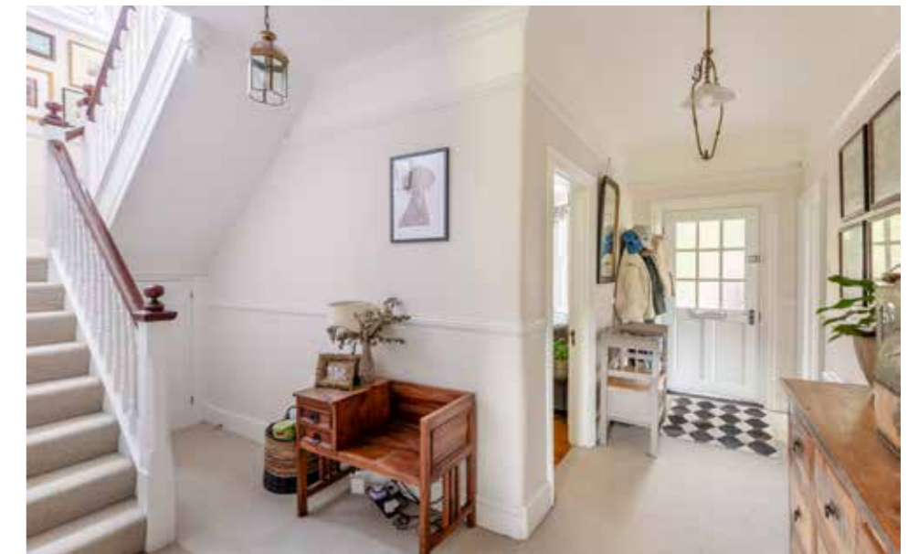
An Impressive Entrance