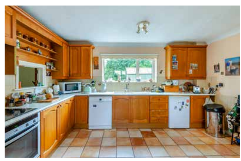
"The kitchen is large enough for informal kitchen suppers and offers beautiful views over the gardens..."