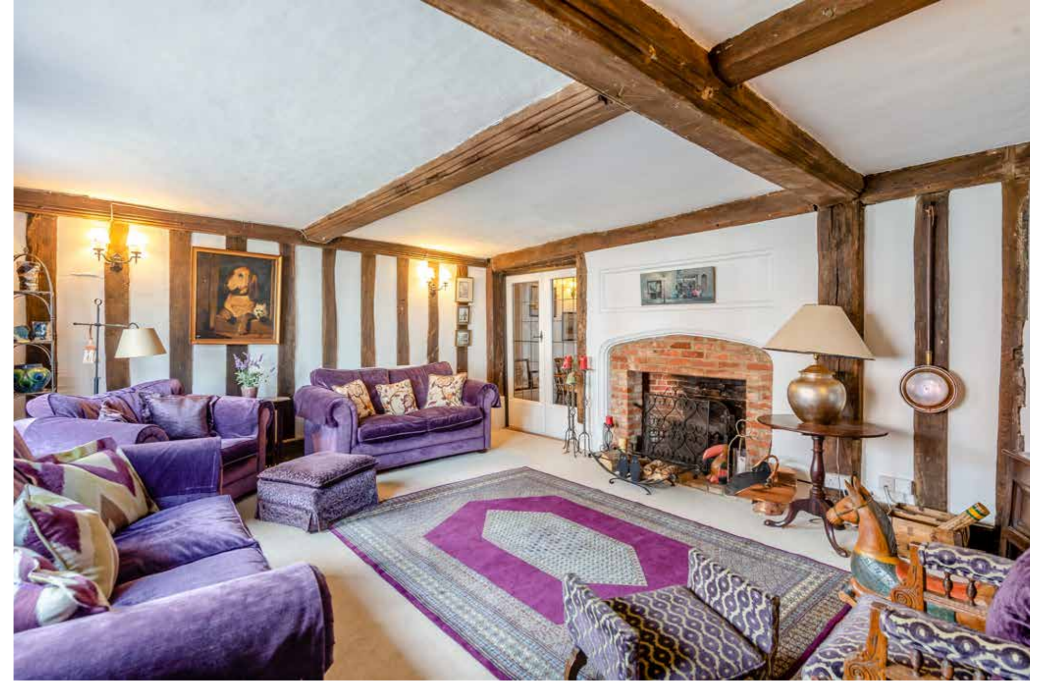
“...the main reception room is resplendent with the original beams on show and a beautiful brick fireplace....”