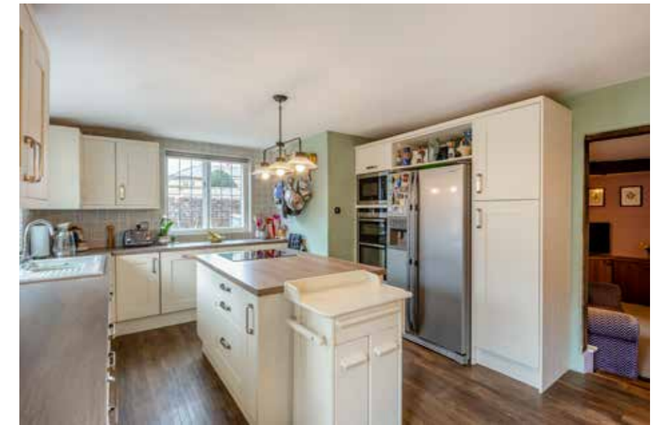
Filled With Light