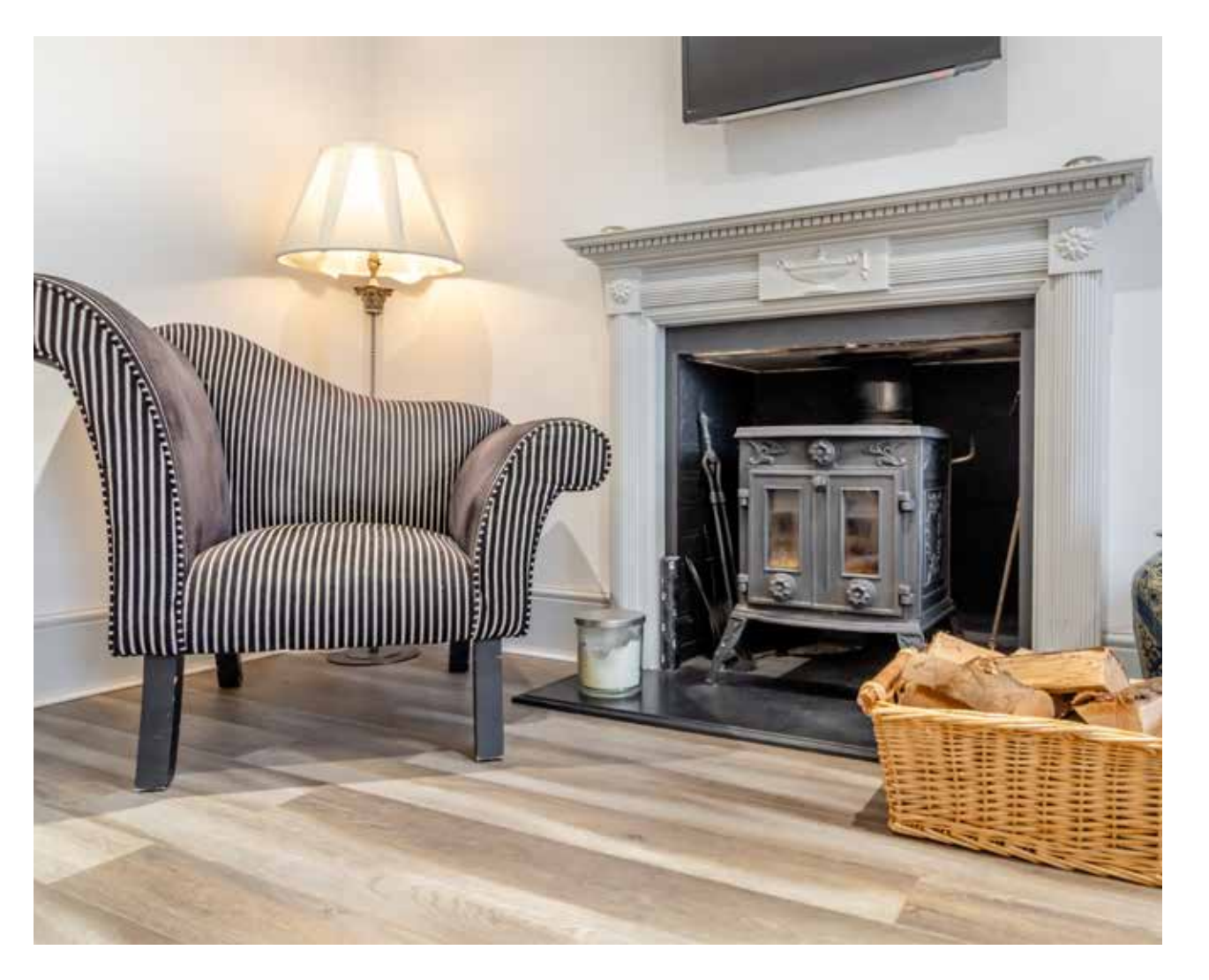
"The property been meticulously designed with an eye to space, light and versatility..."