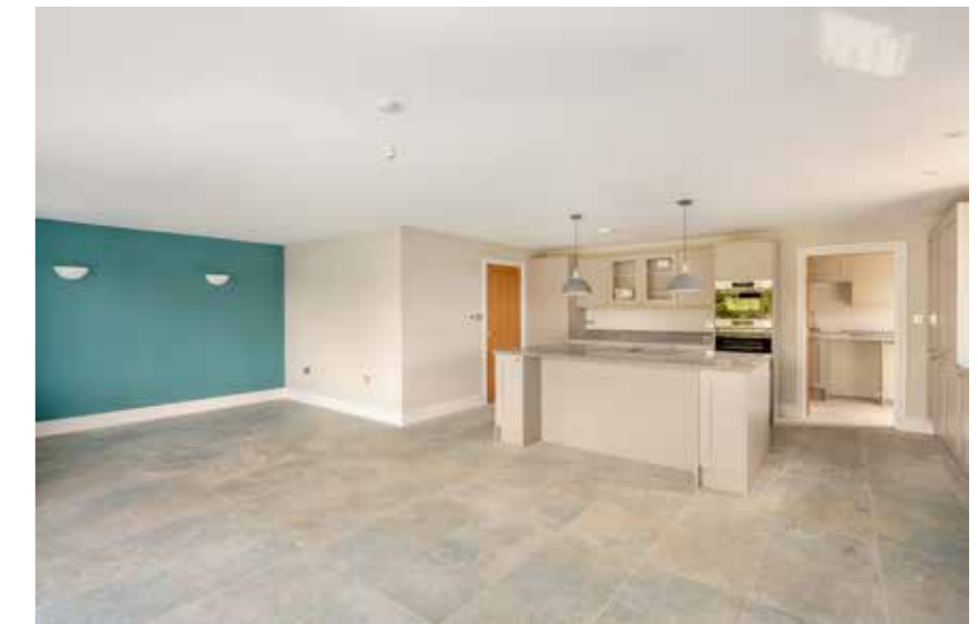
A Stunning Contemporary Space