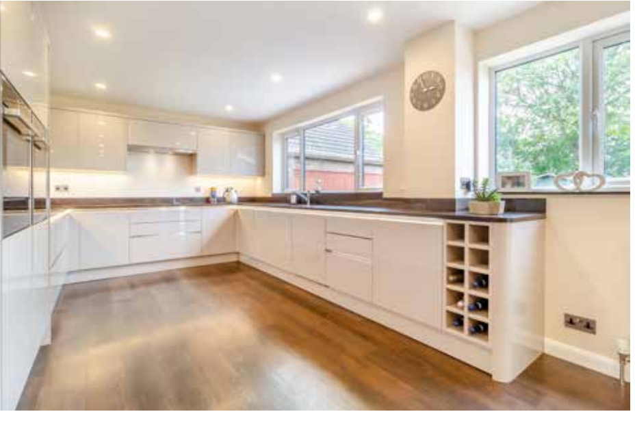
A Stunning Contemporary Space