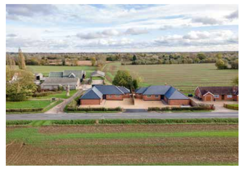
Stunning Suffolk Skies