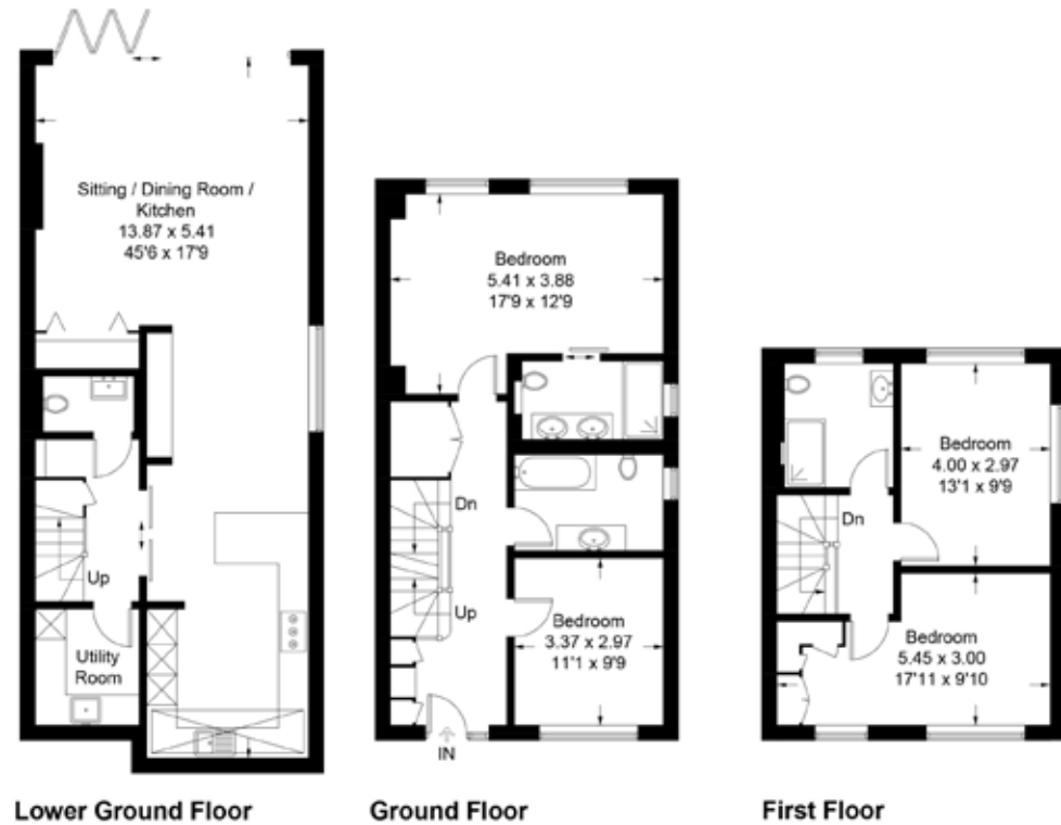
Illustration for identification purposes only, measurements are approximate, not to scale. Imageplansurveys @ 2024

Consumer protection from unfair trading regulations 2008