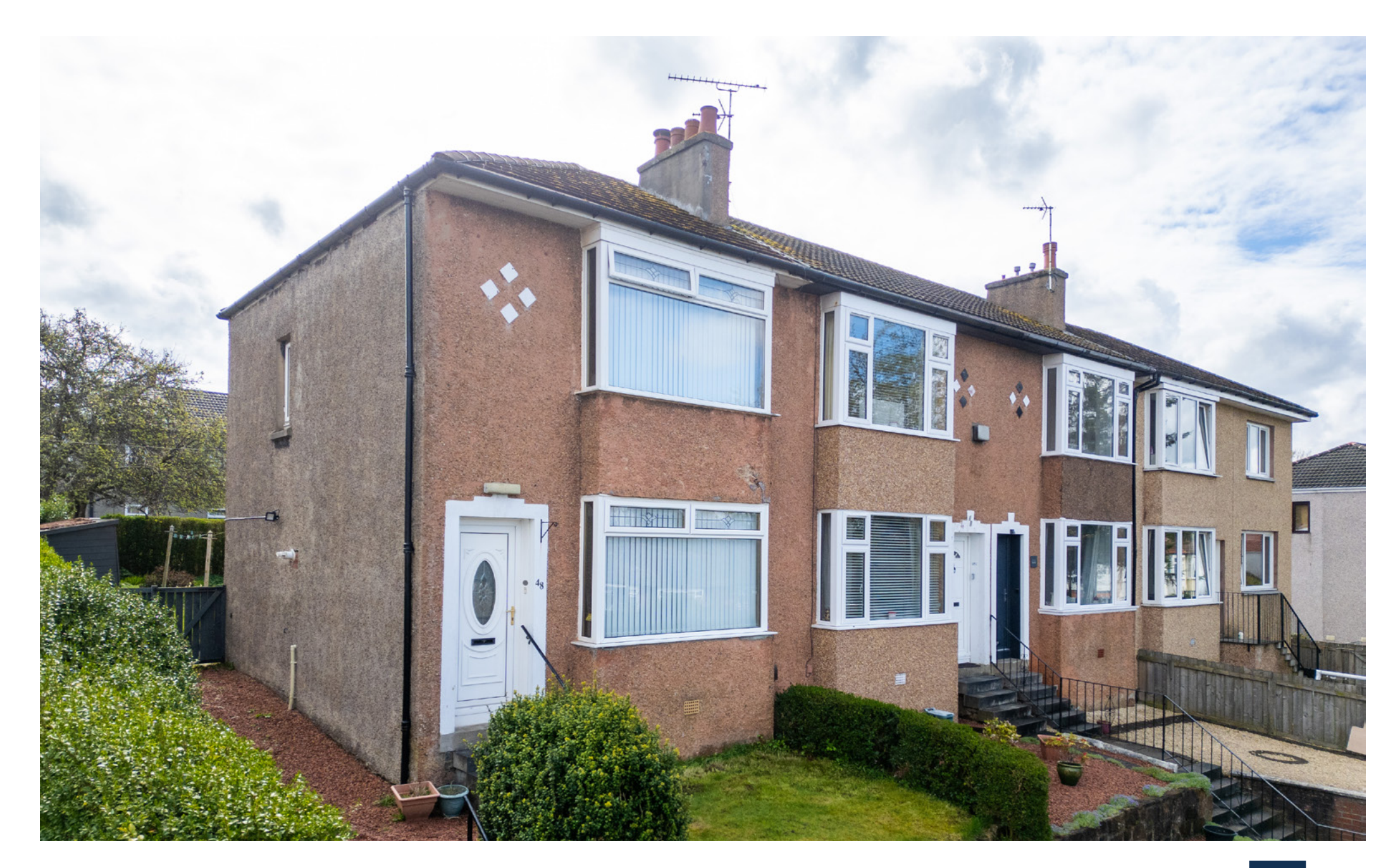
48 The Oval, Clarkston G76 8LZ