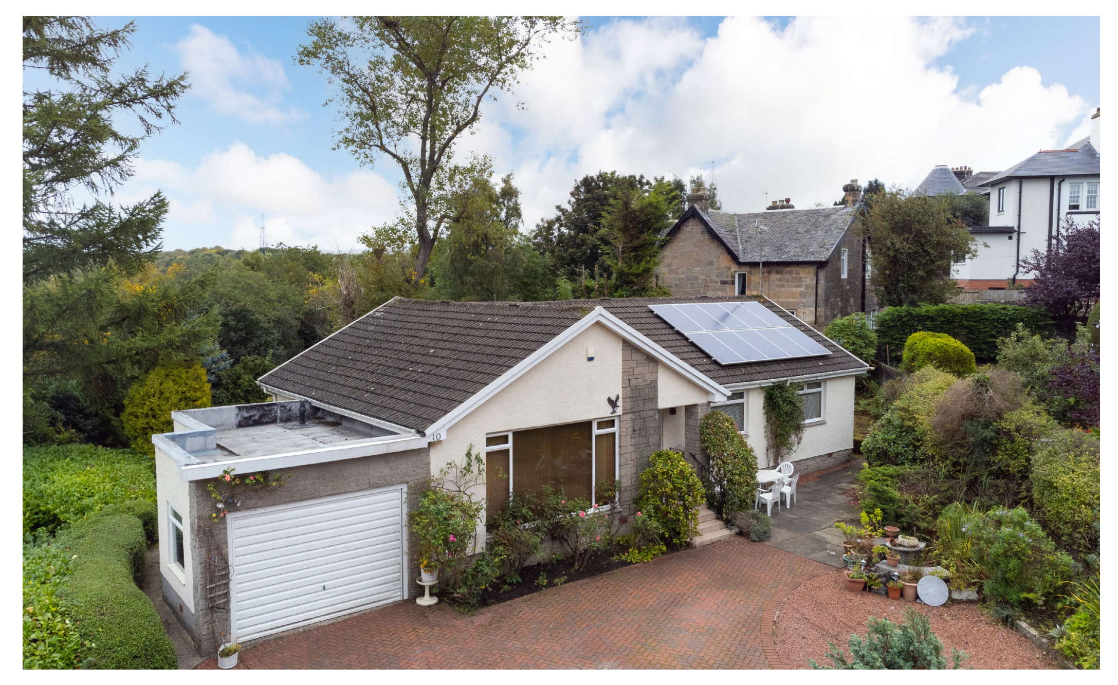
10 Springhill Road, Clarkston