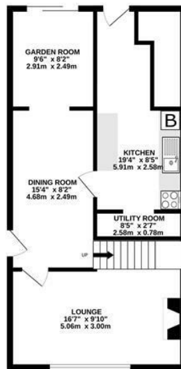
1ST FLOOR 395 sq.ft. (36.7 sq.m.) approx.