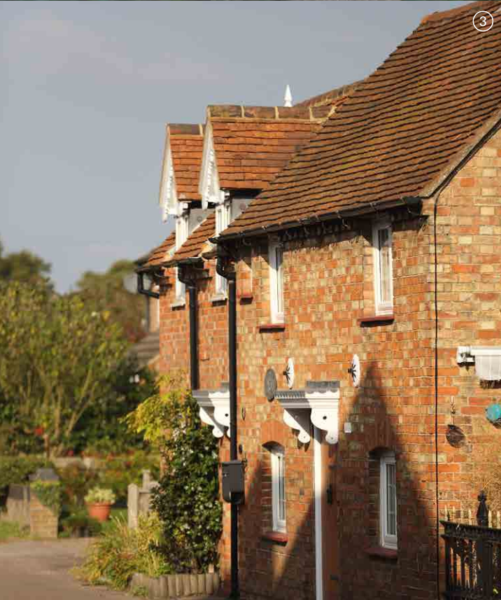
① → Rectory Wood ② → Cranfield Village ③ → Cranfield Village