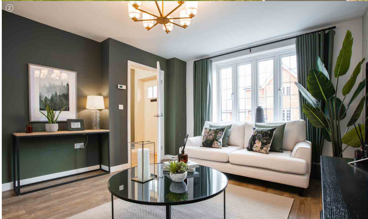
① → Thatcham Place ② → Typical Interior