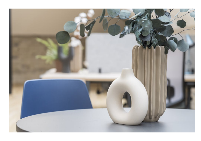
These particulars do not form part of any offer of contract. They are issued as a general guide, but do not constitute representation of fact. Parties should satisfy themselves to their accuracy. Unless otherwise stated, all prices/rents are quoted exclusive of VAT. Richard Susskind - Colonial Buildings , 59-61 Hatton Garden, London, EC1N 8LS Generated on 17/04/2024