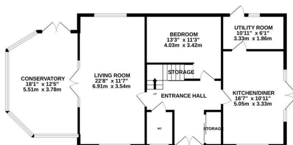
GROUND FLOOR 1018 sq.ft. (94.6 sq.m.) approx.